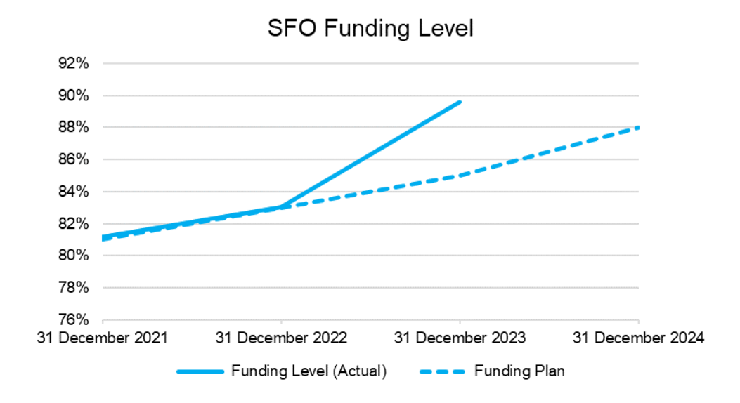
As at 31 December 2023 the funding plan was ahead of schedule.

The Recovery Plan agreed as part of the actuarial valuation made an allowance for post valuation date experience and the improvement to the funding position at 31 January 2023 (the date of certifying the Schedule of Contributions).